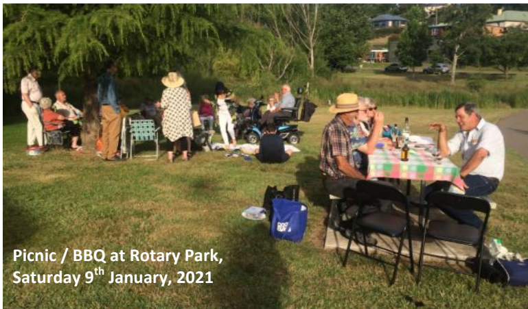
Picnic / BBQ at Rotary Park, Saturday 9 th January, 2021

Remember to keep sending in photographs.