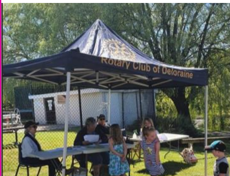
Learn-to-Swim Registration Day