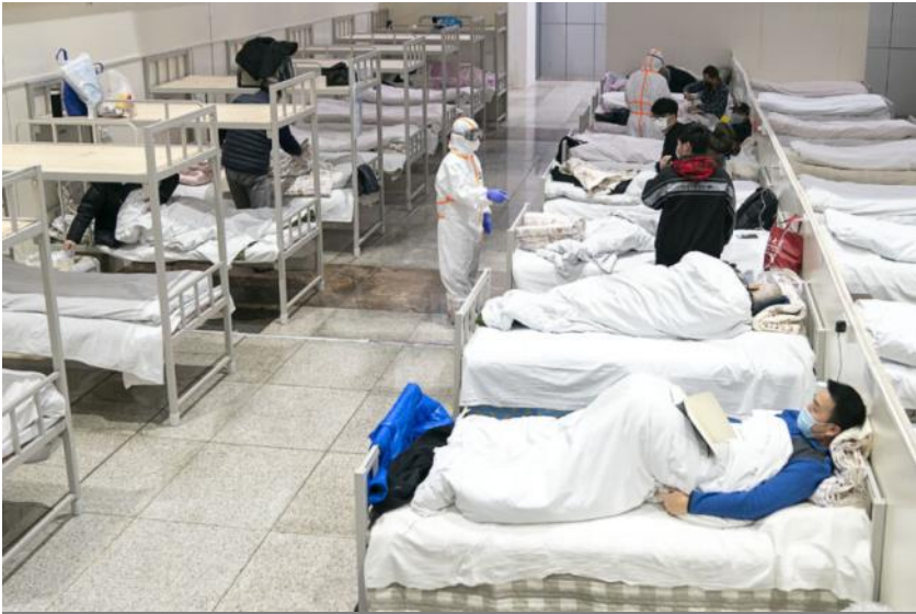
WUHAN, Feb. 5, 2020 — Patients infected with the novel coronavirus are seen at a makeshift hospital converted from an exhibition center in Wuhan, central China's Hubei Province, Feb. 5, 2020. The first makeshift hospital converted from an exhibition center in China's epidemic-hit Wuhan city began accepting patients Wednesday. The hospital can provide about 1,600 beds to infected patients.

It seems like history repeats itself every 100 years, is it just a coincidence?